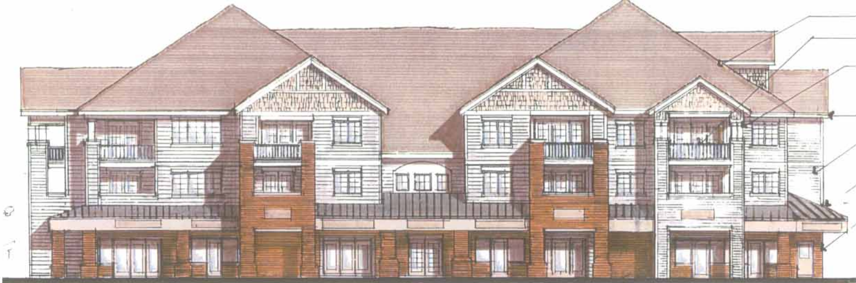
Retail/20 Unit Apartment Building