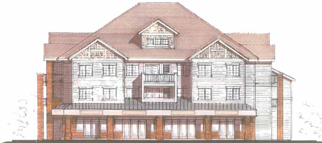
Retail/20 Unit Apartment Building